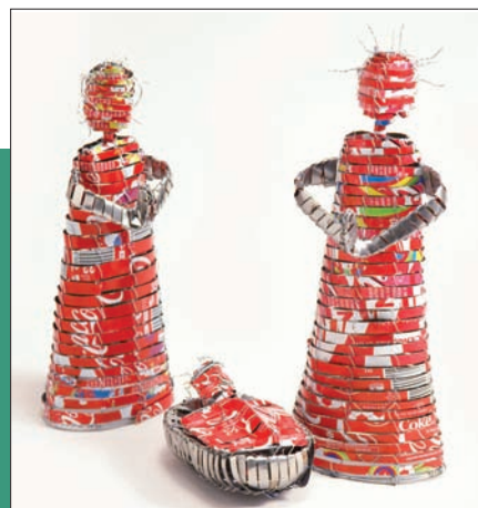
A nativity scene crafted from recycled materials from Ten Thousand Villages.