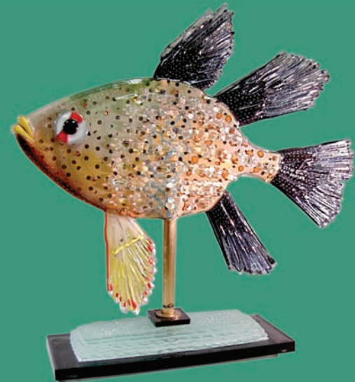
Above: Gifts at Orlando Museum of Art include three-dimensional glass fish sculptures by Vera Sattler. Left: Cornell Fine Arts Museum offers a selection of quality books.