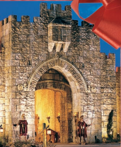
Holy Land Experience