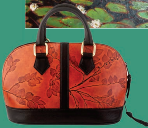
Handtooled Leaf Leather bags are portable works of art available at Timothy's Gallery.