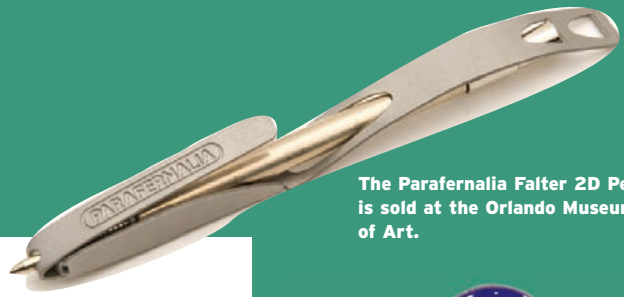
The Parafernalia Falter 2D Pen is sold at the Orlando Museum of Art.

The Gallery at the Grand Bohemian is a great place to find unique and upscale gifts. Tasteful suggestions for her include jewel-encrusted decorative figurines that open to reveal an exquisite necklace