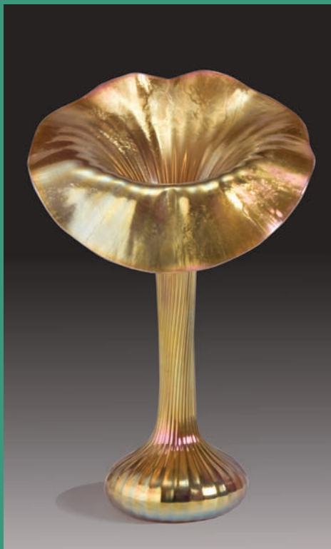
Fine vases are offered at the gift shop in the Charles Hosmer Morse Museum of American Art.