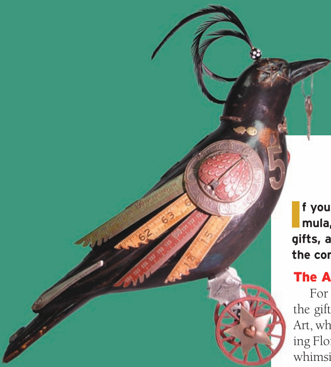
Florida artist Jim Mullan creates carved-wood birds adorned with found objects.

tote bags, table runners, placemats, coasters and other decorative items, priced from $12.95 to $72. Motawi ceramic tiles, $25-$132, are another great