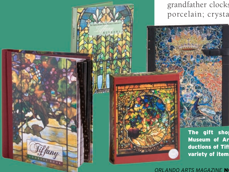
The gift shop at the Morse Museum of Art features reproductions of Tiffany windows on a variety of items.

bearing a miniature matching figurine, $55-$185, or one-of-a-kind handmade jewelry created with unique natural elements, antiques and found objects by Lorena Lacayo, $55-$350.