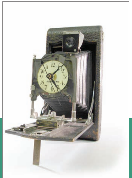
Debra Dressler's clocks are made with found objects and are available at the Orlando Museum of Art.

Freelance writer Denise Bates Enos is a regular contributor to a number of local and national publications, including Pool & Spa Living magazine, The Orlando Sentinel and Orlando magazine.